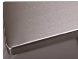
Stainless Steel Pan